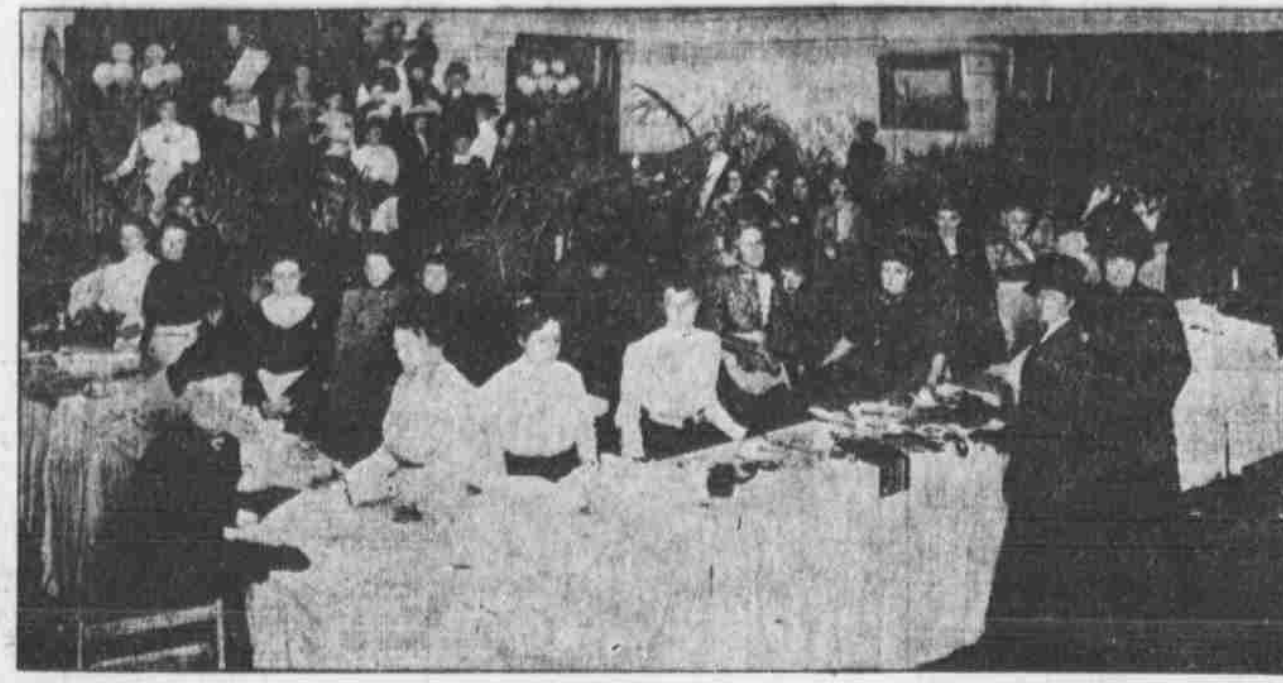
CHURCHES OF OMAHA HOLDING ING CHRISTMAS BAZAAR IN THE ROTUNDA OF THE BEE BUILDING.

All diamonds sold by us are sold under contract to buy back at any time within one year at price paid, less ten per cent; or full price allowed in exchange at any time. We have a large assortment of rich jewelry gift-suggestions which you should see before buying elsewhere.