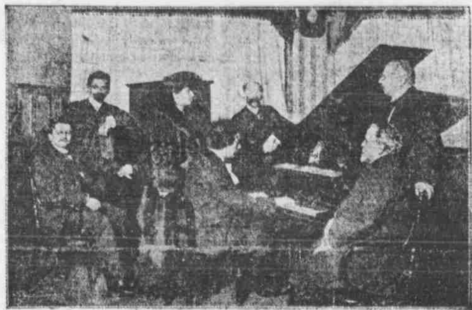
PADEREWSKI PLAYING FOR WELTE-MIGNON RECORDING INSTRUMENT