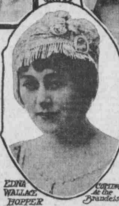
EDNA WALLACE HOPPER At the Brandeis