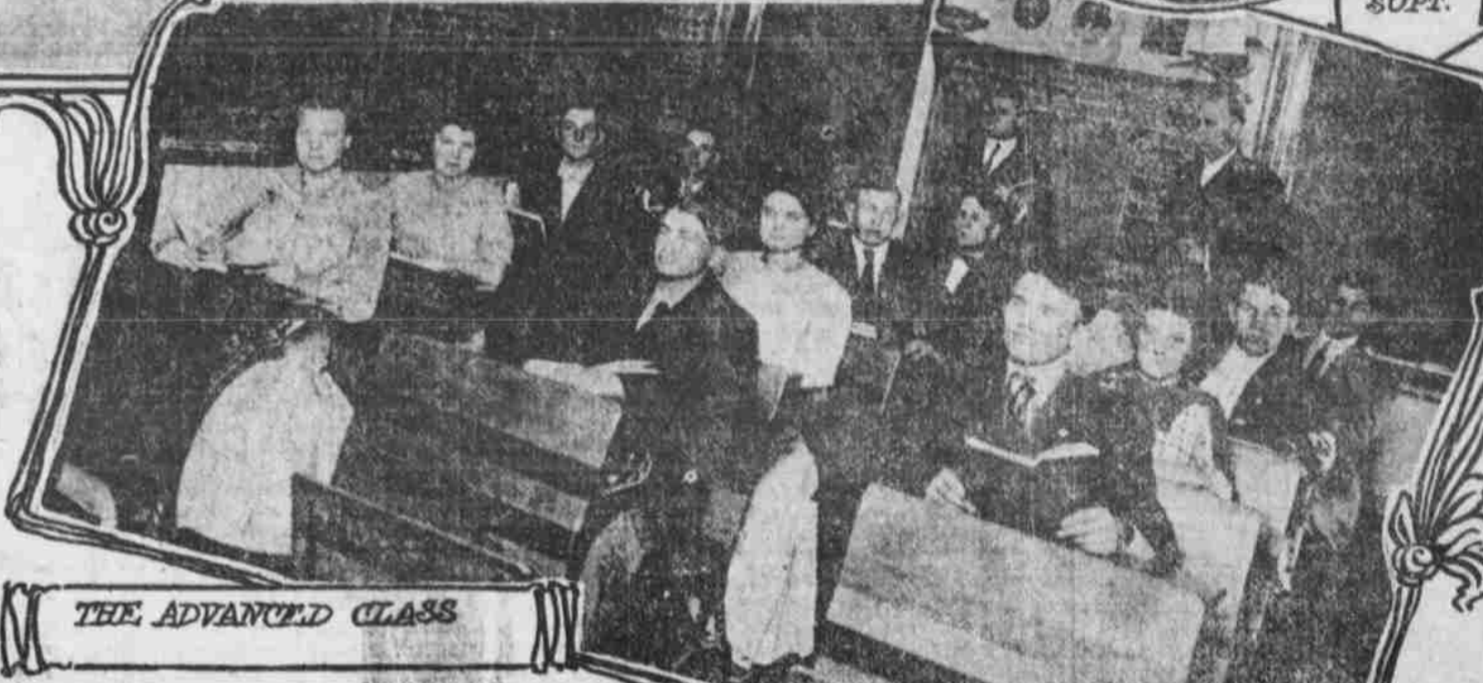
THE ADVANCED CLASS