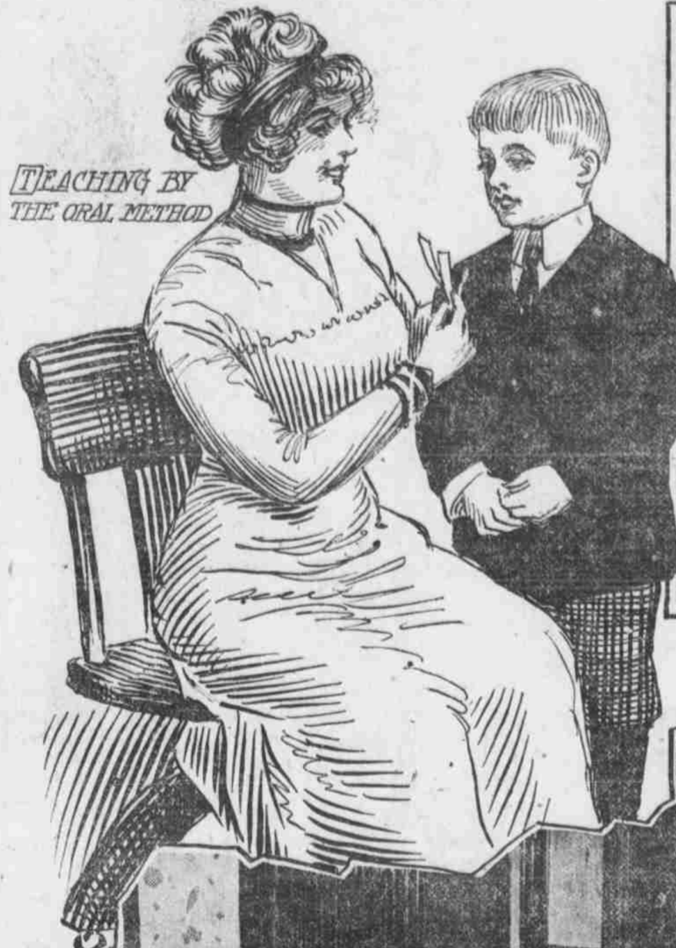
TEACHING BY THE ORAL METHOD