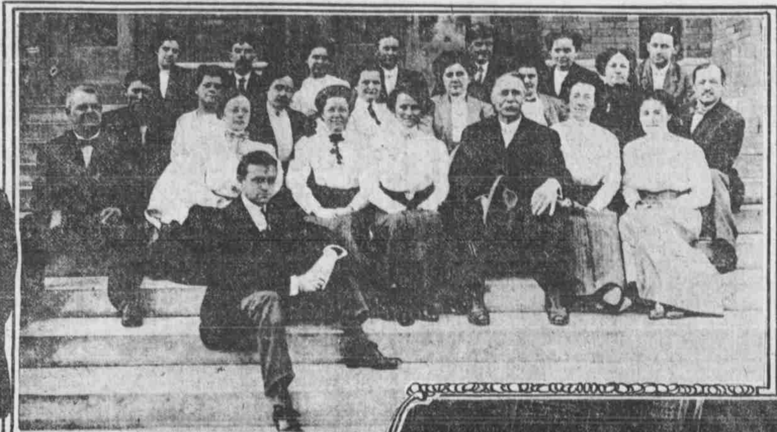
SUPI. BOOTH AND STAFF