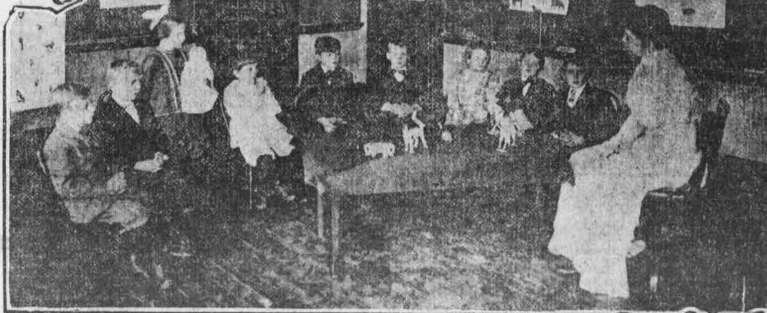
IN THE KINDERGARTEN GRADE