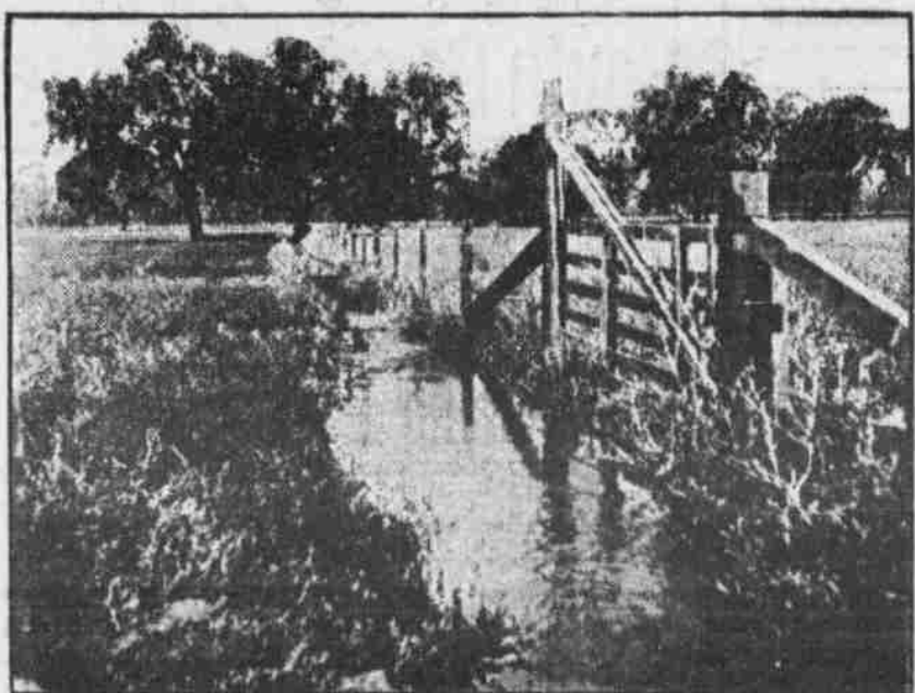
SCENE ON TEHAMA COUNTY LAND