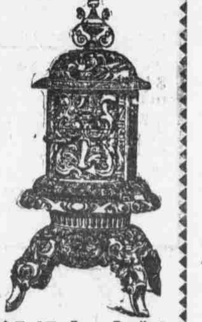
$5.15 For an Excellent $8.50 Soft Coal HEATER

Has full cast iron top and base and full blue steel drum, heavy grates, screw draft air attachment for regulating the inflow of oxygen, has pretty turn and is artistically trimmed with silver nickel. A first class heater in every respect.