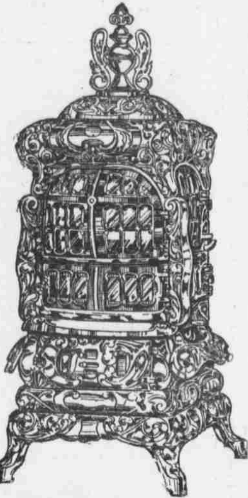
$23.95 For an Excellent $35 Base Burner

Howard overdraft heaters will effect a saving to you of at least one-half your fuel bill. They are so scientifically constructed that it is absolutely impossible for them to consume more than half the fuel required by the ordinary soft coal heater. They have full blue steel bodies cast iron top and base and very heavy guaranteed fire pot. Handsomely trimmed in silver nickel.