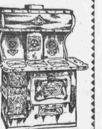
$22.50 For a Guaranteed $35 STEEL RANGE

We offer you an excellent well made base burner, constructed by expert workmen, equipped with guaranteed firepot; has revolving and shaker grates, has heavily nicked swing top, with patent magazine cover, patent automatic feed magazine, large cold air circulating flues, air-tight fitting doors, patent cold air regulators, large base and heat radiating surface, and a base burner richly ornamented with silver nickel trimmings, at the above low price.