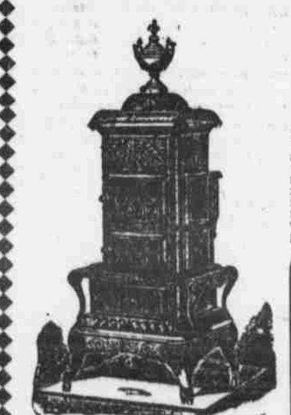
$19.75 For This Excellent $30 BASE BURNER

Your Old Stove Taken in Exchange on the Purchase of a New Steel Range.