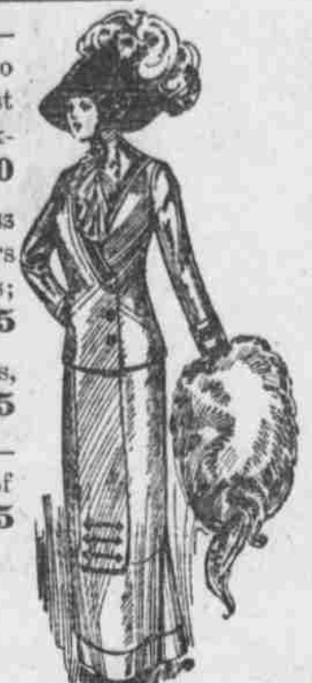
Fine Furs in assortment is unequaled,

Hundreds of other delightful bargains will be shown Monday, among them a very choice line of One-piece Velvet and Imported Cloth Dressesgreatly underpriced at $25.00, $30.00, $35.00, $40.00, $45.00. Don't miss them. Our Children's Section is replete with everything desirable in garment styles for the youngsters. Just what you want at saving prices. Hundreds of New Crown Jewel Tailored Suits at $25.00.