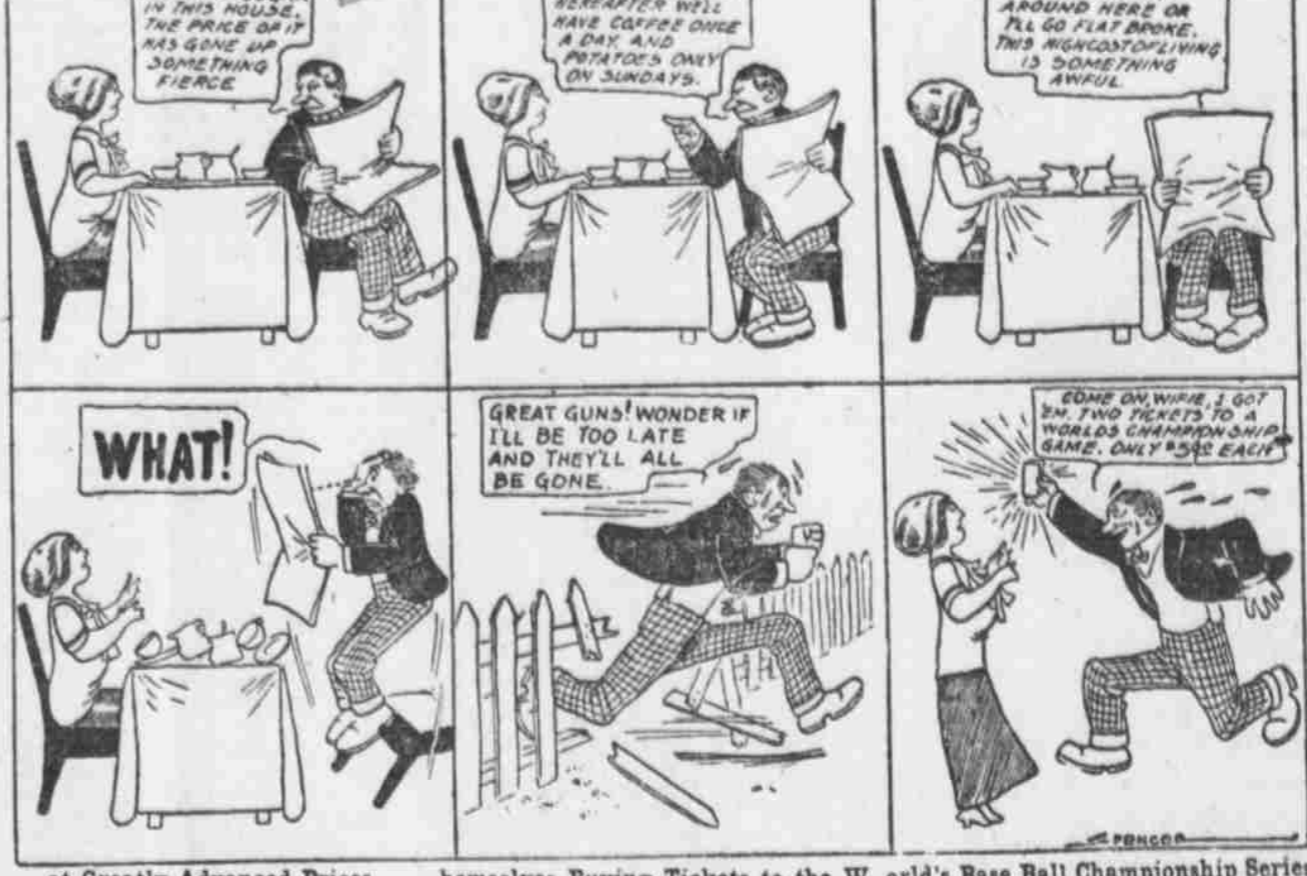
at Greatly Advanced Prices. Eastern Fans Are Falling All Over T From The Denver Republican.