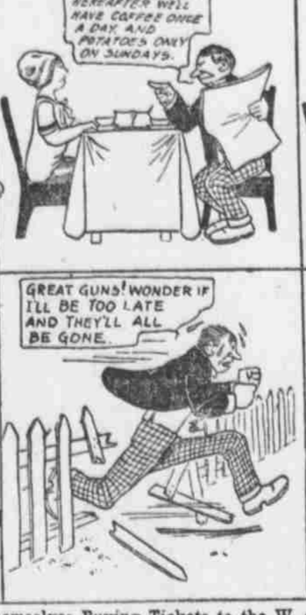
at Greatly Advanced Prices. Eastern Fans Are Falling All Over T From The Denver Republican.