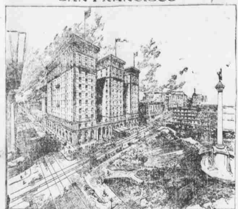
A big hotel where the little things count.

European Plan -:- From $2.00 Up Under the Management of James Woods