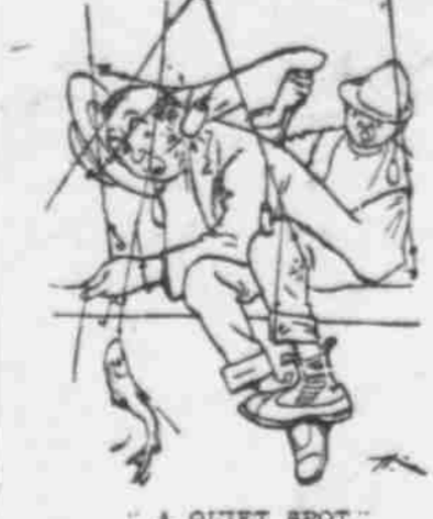
A QUIET SPOT