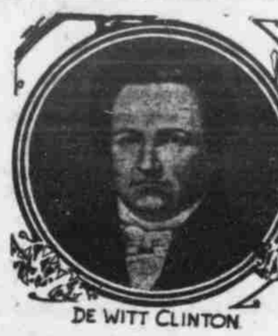
DE WITT CLINTON

When De Witt Clinton's foresight and enterprise resulted in the building of the Erie canal, he helped to build up American commerce by connecting the Great Lakes with the ocean by way of Buffalo, Albany and New York.