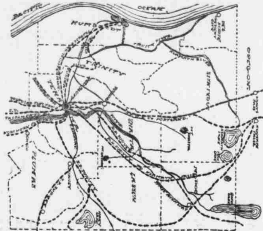
Red Bluff will soon be a transportation center. Its facilities for distribution are great. It is the head of a navigable stream, Sacramento River, and is a natural distributing point for rail and wagon roads to an empire in a condition of continuous development. It draws from every direction, which fact is shown by the accompanying map of its roads, highways and proposed railroad and highways with Red Bluff as a terminus—Sacramento Union, Aug. 1.

Enter anytime—first day or last—with full and equal chance of success.