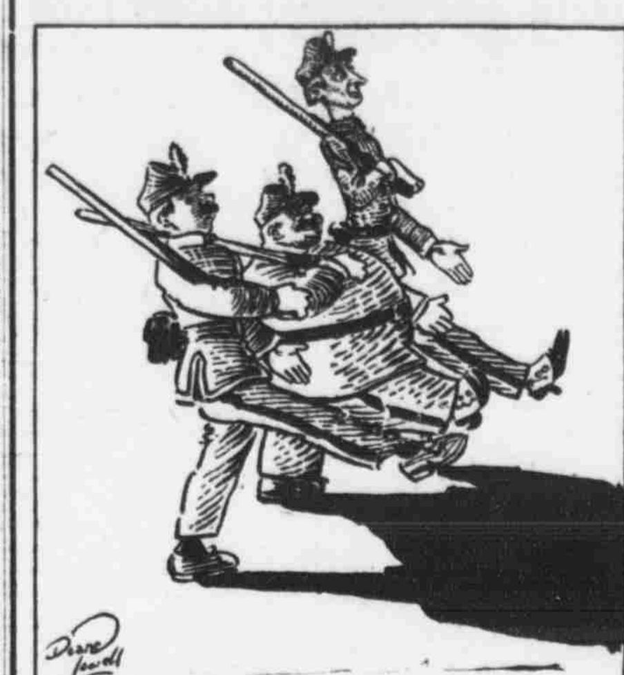
No. 1—Wednesday, August 16, 1911.