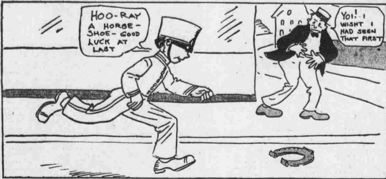
DANNY FINDS A HORSESHOE AND NATURALLY IMAGINES GOOD-LUCK-ASFOLLOWS