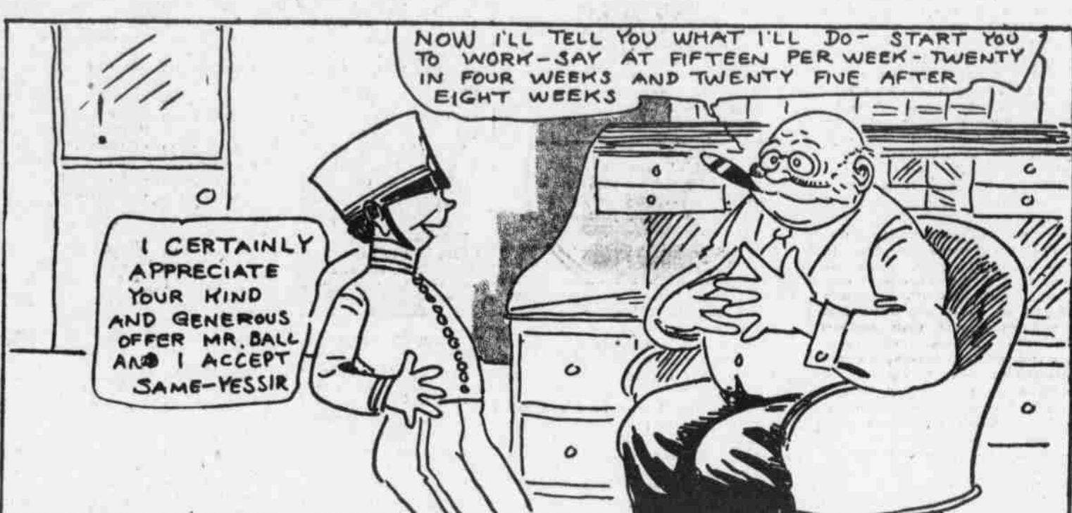
BUT! HERE COMES THE REAL FACTS. THIS! THIS IS WHAT HAPPENED