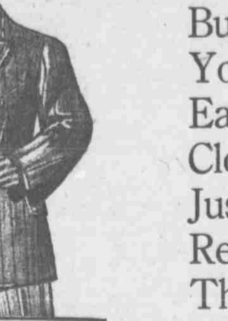
Copyrighted, 1911, by Schwab Clothing Co.

Enter the Bee's Booklovers' Contest now.