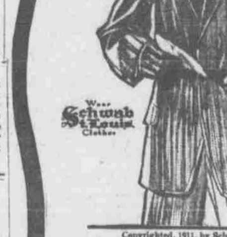
Copyrighted, 1911, by Schwab Clothing Co.