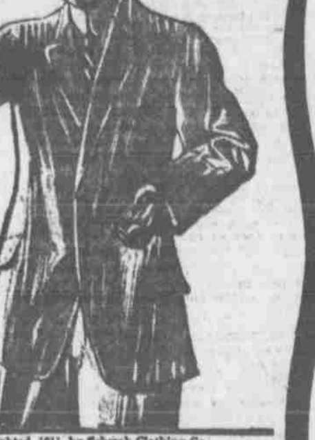
Copyrighted, 1911, by Schwab Clothing Co.

Enter the Bee's Booklovers' Contest now.