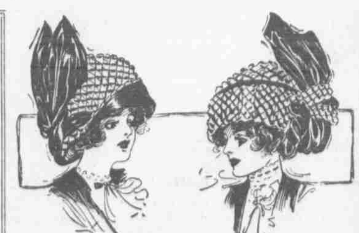
Showing Two Popular Styles of Street Hats at Brandeis

Everyone is Delighted With the Newest Fashionable Shapes