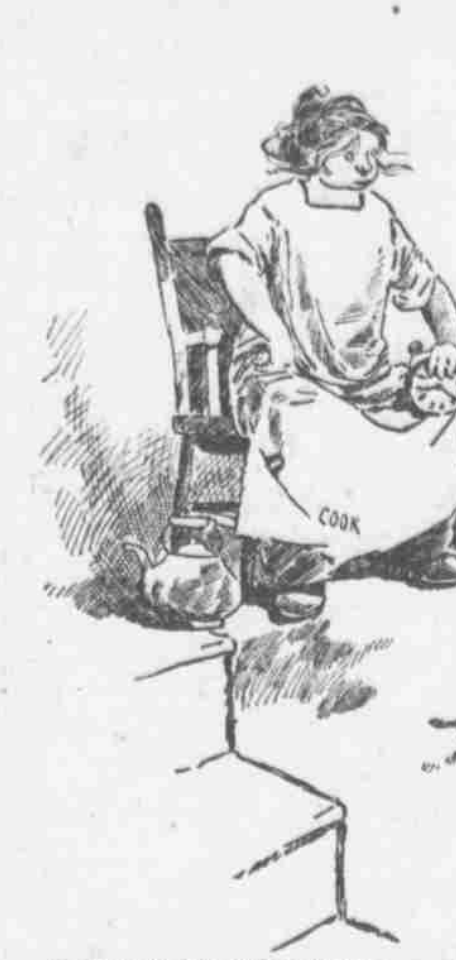
From the Cleveland Plain Dealer.

Somehow within a radius of 500 miles of Omaha there is a happy hobo, in the hobo's eyes, except for two things—those two being a brand new pair of $1 tan shoes.