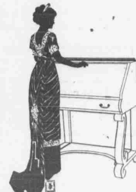
$31.50 Writing Desk —Circassian walnut veneer, handsome, strongly built, best quality..... $20.00