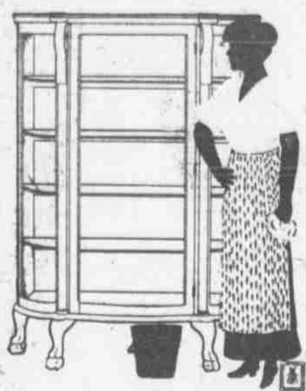
$32.00 China Cabinet —Pretty oak veneer, spacious shelves, glass front and sides..... $25.00

"To dream dreams of fanciful places you have imagined to be the richest gardens of the world, surround yourself with suggestive furniture." Thus has a connoisseur of the furniture art pithily expressed himself. To think of beauty, put beauty about you; to take little journeys into the mystic lands of history, where the arms of ancient heroes clashed in glorious struggles for supremacy, gather about you dramatic-breathing, romantic-pulsing furniture of classical periods. Then one sees back into the inspiring days of his ancestors. He beholds charging knights clashing on the Field of the Cloth of Gold. Noble castles struck by mounting rays of the sun catch his attention and direct it far below to the slowly coursing waters of a broad, blue stream. Gothic forms break forth upon his vision as he watches the capricious French pulling down evidences of a monarchy or rushing in attack upon the crumbling Bastille. To see these stimulating pictures one must look upon handsome furniture. Among our stock are many pieces that carry one back into the pages of history, where the French, the English and other people fought out their early struggles. These artistically designed, skillfully constructed chairs, tables, beds, buffets, davenport and dressers infuse pictures of their animated periods into the breast of him who looks upon them. During our January Green Seal of Quality Sale these and many other articles are being sold at prices far below the original Tag Policy mark.