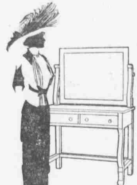
$45.00 Dressing Table —Circassian walnut veneer, 31 inches high, French beveled mirror, 25x21..... $30.00