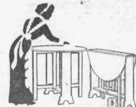
$13.00 Drop Leaf Table —Solid oak, highest quality, skillfully made, splendid design..... $10.00