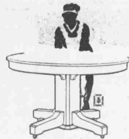
$36.50 Craftsman Oak Table —Beautiful, high class construction, 54-inch diameter, strong..... $31.00