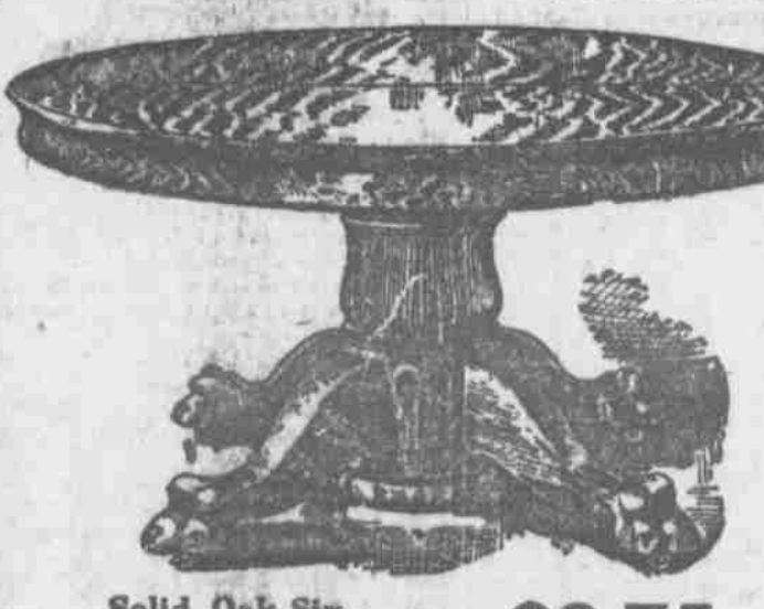
Solid Oak Six-Foot Extension Table $9.75

Every day our trade grows in Omaha. People read our advertisements in the Bee and they know we couldn't continue to tell the public that our prices on furniture are 20 per cent below those charged in Omaha if that wasn't so. Then they make out a list of the things they want to buy. They take this list and price the various articles in the different Omaha stores and then come to us. They learn that what we say is so and that they can save $2.00 on a $10.00 purchase or $20.00 on a $100.00 purchase and we have added another Omaha customer to our list. We make just as much on each sale as the Omaha merchant makes, but out here in South Omaha our rent and operating expenses are low, which accounts entirely for our lower prices. Suppose you pay us a visit. All South Omaha cars pass our store—transfer from any Omaha car to any South Omaha car and get off at 24th and L streets. We are right at the corner. We carry the same lines as the Omaha stores but sell them cheaper, that's all.