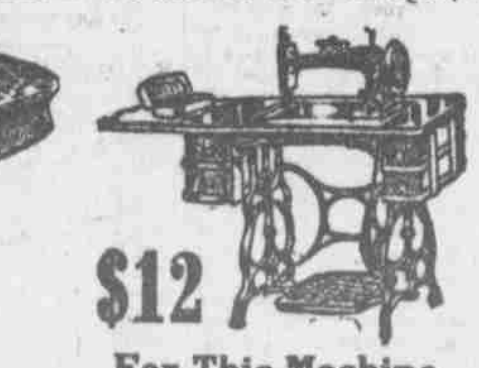
$12 For This Machine

This is the very latest improved drophead model, with full quartered oak case automatic tension indicator and stitch regulator and full ball bearing. It makes either long or short stitch—as desired. Full set of attachments go with each machine.