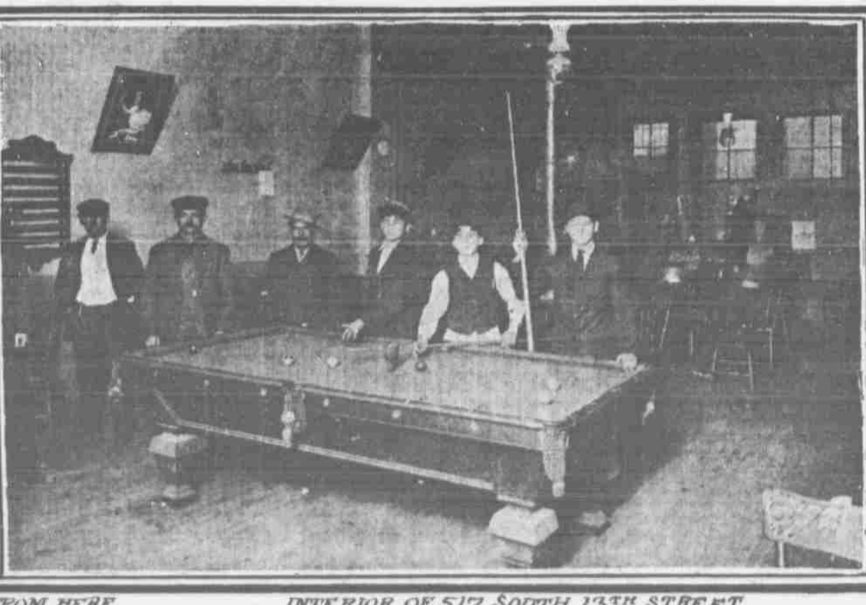
INTERIOR OF 517 SOUTH 13TH STREET