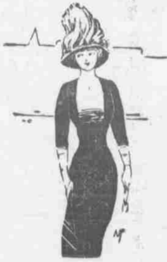
"SOMETIMES I LONG TO BE LIVING IN TOWN AGAIN."

Friday—The country is lovely at this time of the year, but sometimes I long to be living in town again.