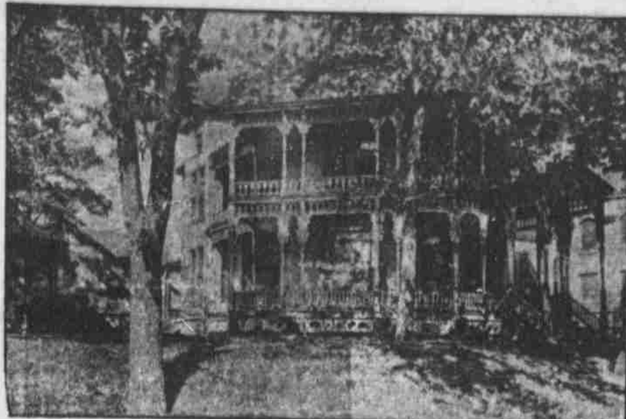
518 SOUTH TWENTY-SIXTH STREET.