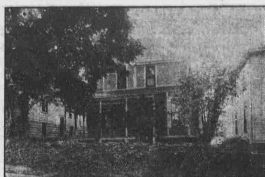
417 FARNAM STREET.