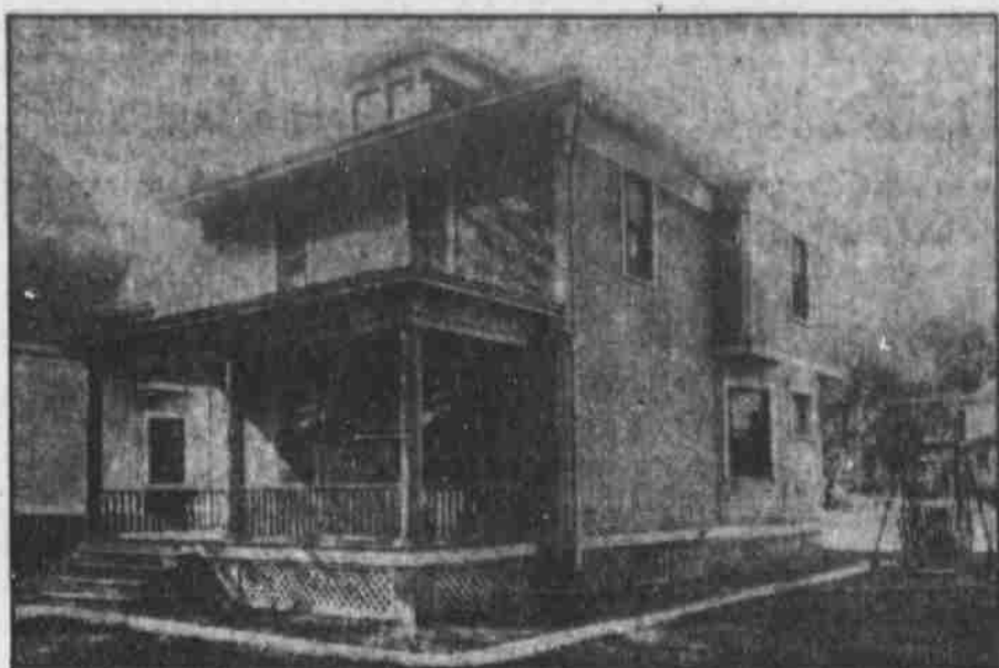
254 PRATT STREET.