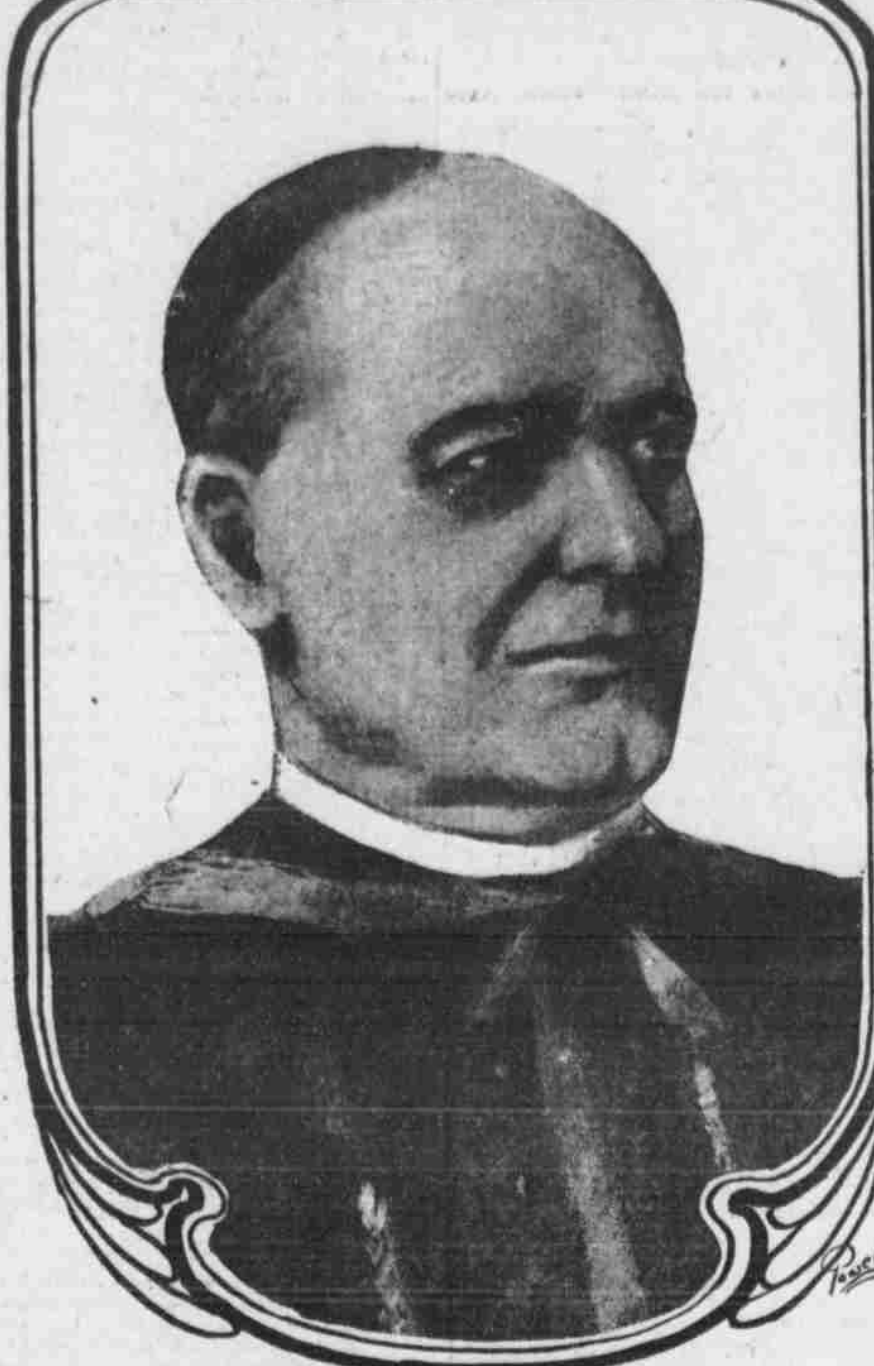
CARDINAL VINCENT VANNUTELLI

1-Law, the Objective Norm of Human all reassured. In my black maid's dress