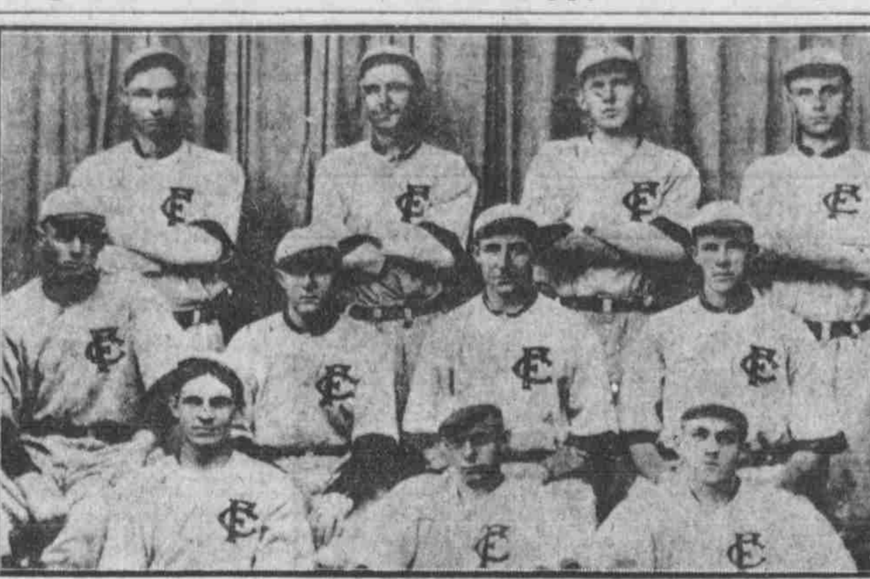
FALLS CITY TEAM OF THE MINK LEAGUE.