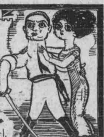
"HERO." shooting, boxing, aviating and other office accomplishments while studying the hero business. Nobody but all the readers respects that the beautiful girl he finds floating on an iceberg in the middle of the ocean is the princess of Kazook, a principality founded by royalties, dramatic rights and serial rags-off. After rigging up his coat as a sail for the iceberg, handing seventeen whistles a slumber punch on the nose, fighting dools with eleven assorted villains, kicking a castle off the Balkans with the precision of a balking mule, pulling the throne from under a king as he is about to sit down, and rescuing the girl from death in more forms than the accident insurance policies describe, he learns she is a princess and, being a staunch member of the American Heroes' union, he renounces her.