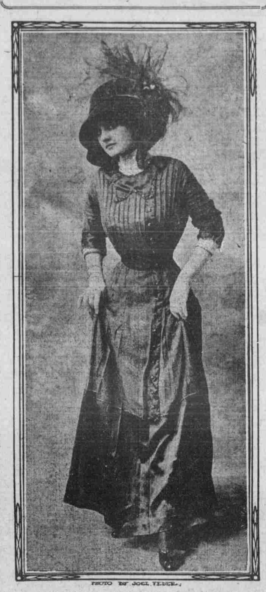
PERFECT silk in brilliant red and gold colorings, forms the foundation for this chic little frock. The tucked overdress of black chiffon is trimmed with bands of soft satin, giving a substantial finish to this sheer fabric.