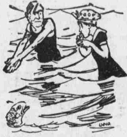
THE BOSS GAVE HIS WIPE A SWIMMING LESSON.

house and lot" "He has? Then I give ye a photo album to put in it."