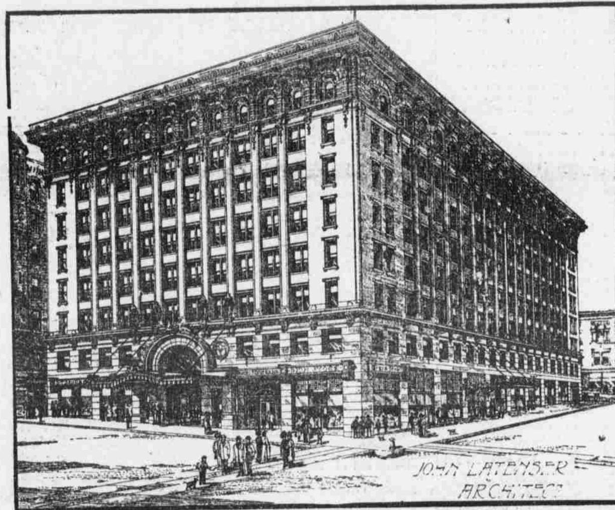
THE NEW BRANDEIS THEATER BUILDING The forward movement of Omaha is well illustrated by the rapidity with which the offices in this new building are being leased. Some desirable offices are still to be had.