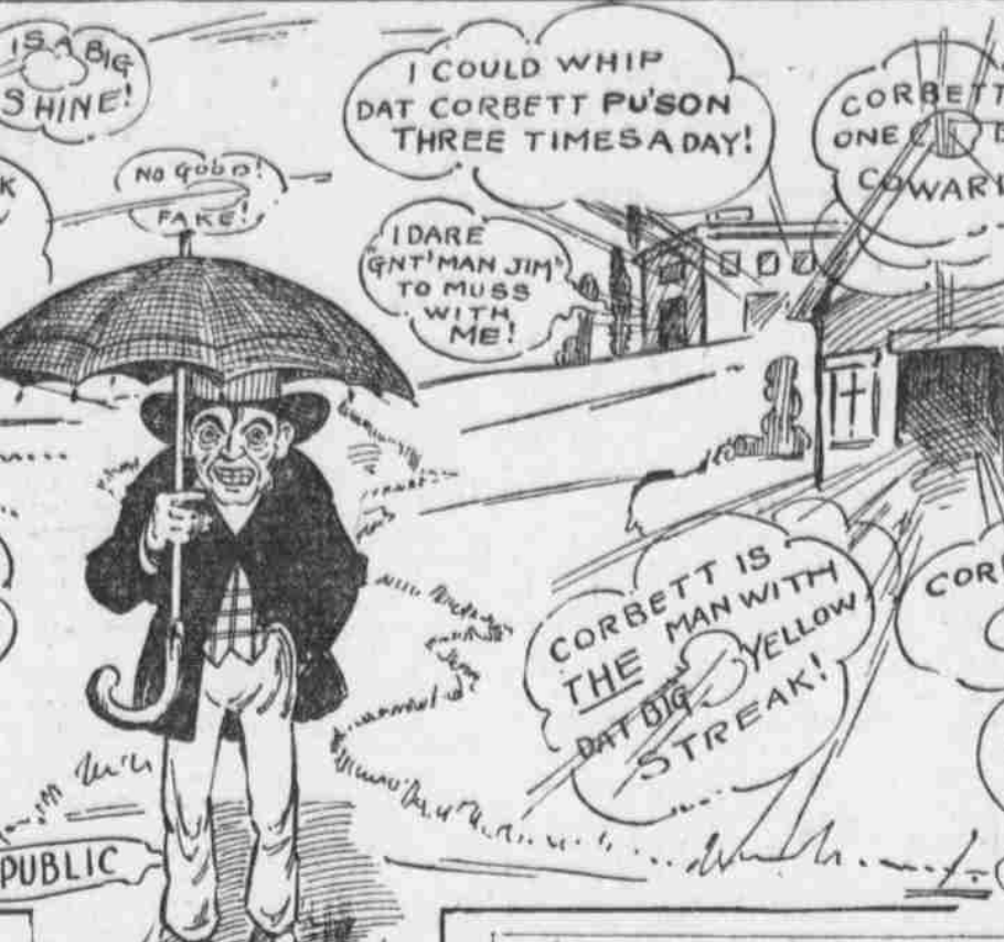
CORBETT IS ONE OF THE BIG COWARDS!