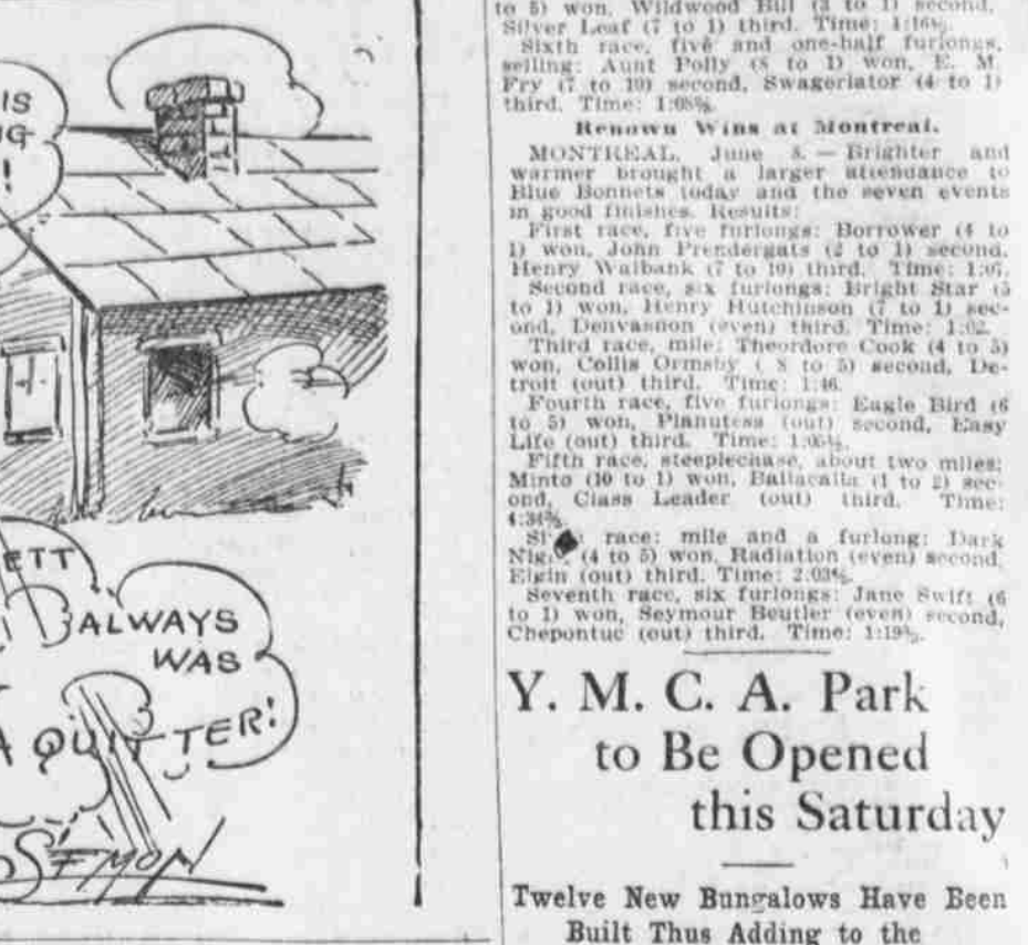
CORBETT IS ONE OF THE BIG COWARDS!