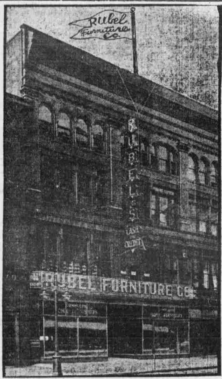
OUR OMAHA STORE

OUR POLICY: At the very outset we desire to make known the policy that it is our intention to pursue.