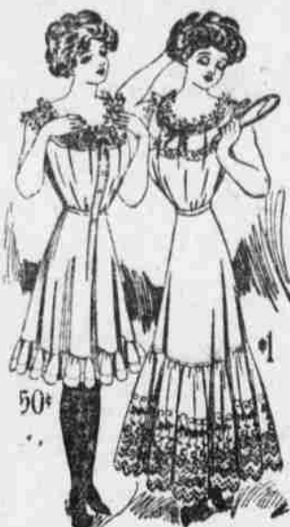
New lots of women's fine muslin underwear ..... 98c

Undermuslins at 69c Gowns in empire and kimono styles, chemise, extra long skirt, white petticoats with rows of lace insertions, drawers, etc., ..... 69c