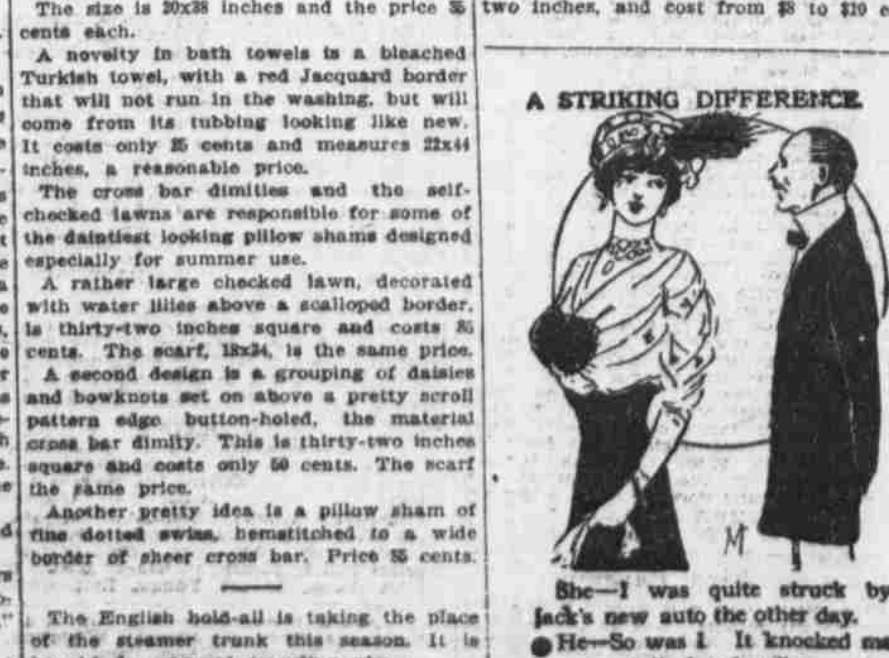
She-I was quite struck by Jack's new auto the other day. He-So was I. It knocked me down and displaced a rib.