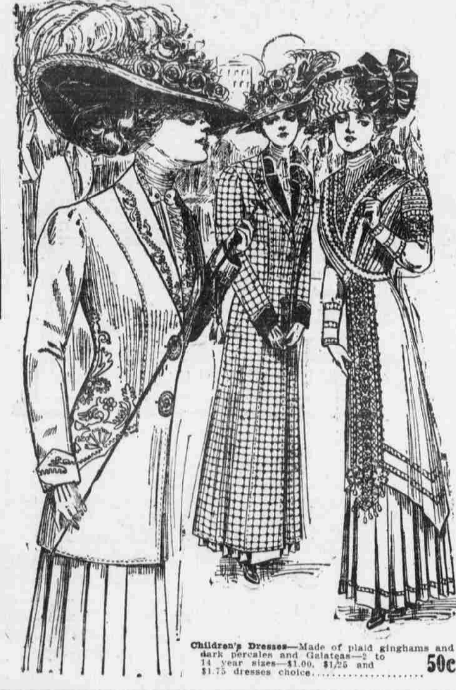
Children's Dresses—Made of plaid gingham and dark percales and Galatea—2 to 14 year sizes—$1.00, $1.25 and $1.75 dresses choice. 50c

$20.00 Tailored Suits $5.00 —The wonder of the suit trade. The maker pressed for cash was forced to accept the inevitable and sell at any cost. Season's most advanced styles, in all wool serge—black, navy and gray. Positively none to dealers—one suit to a customer—absolutely best $20.00 suits made; now for $5