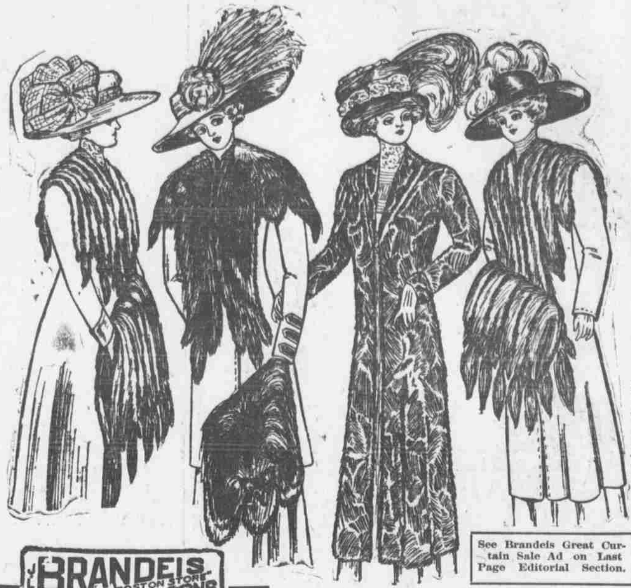
See Brandeis' Great Curtain Sale Ad on Last Page Editorial Section.

The fact that we sell such immense quantities of better class furs enables us to buy at much lower figures than ordinary dealers. You have the advantage of much larger varieties, more moderate prices and absolute reliability when you select your furs at Brandeis Stores.