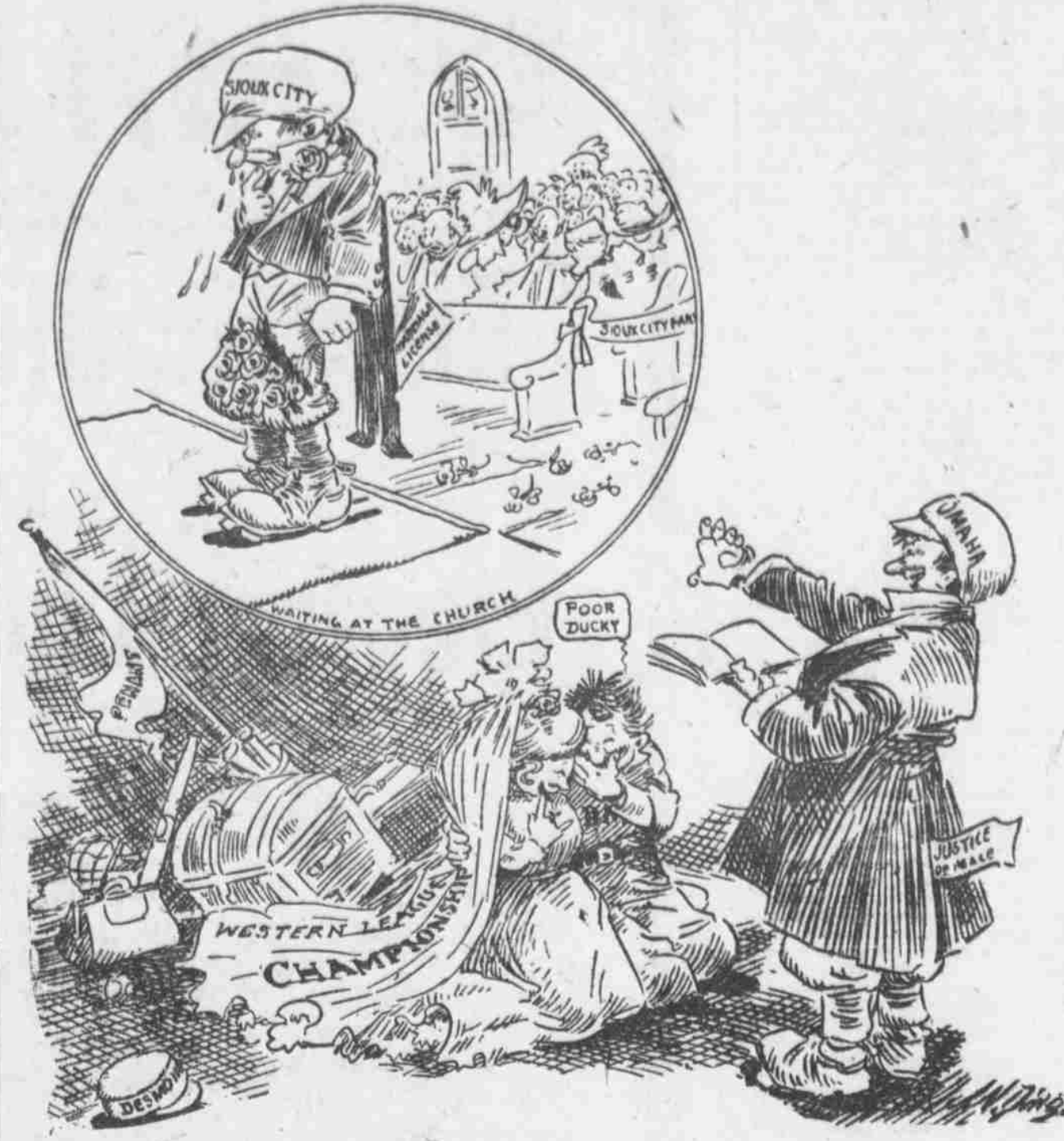
Eloped with the "Best Man"-And the Invitations Were All Out, Too.