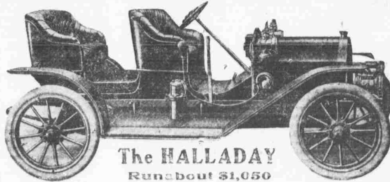
The HALLADAY Runabout $1,050

The Halladay is the product of one of the best factories. It was tested three years before it was put on the market. It is now one of the popular cars east. I have sold several carloads of Halladays in the last few weeks. Four passenger, 100-in. wheel base, 4 cylinder, 34-h. p., Bosch magneto, direct coupled bevel gear, water cooled.