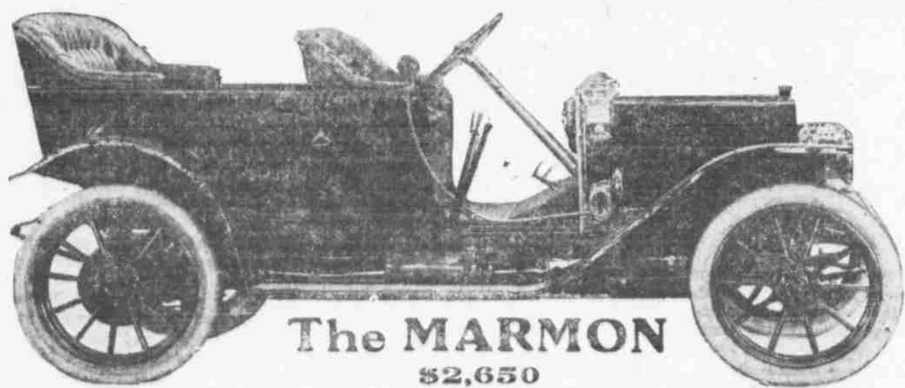
The MARMION $2,650

Here is the easiest riding car in the world. Here is the car that made the best road record in the Glidden Tour of any car in its class. Here is a speedy car. A strong car. A reliable car. It is graceful; easy of operation; water cooled; 32-40-h. p.; Bosch magneto; transmission selective; sliding gear on rear axle; leather faced cone clutch with relieving spring under-leather. See it by all means.