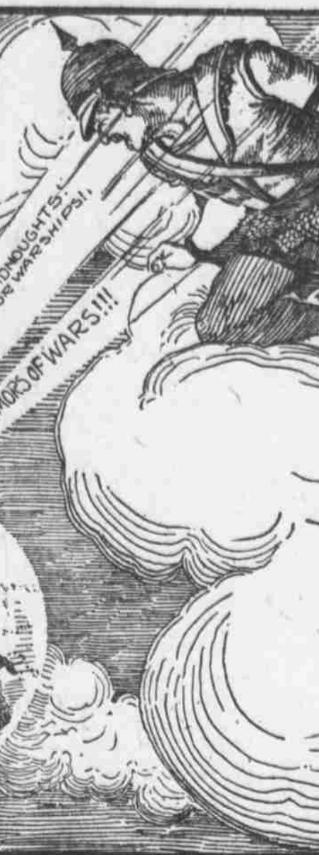
From the Baltimore Sun.