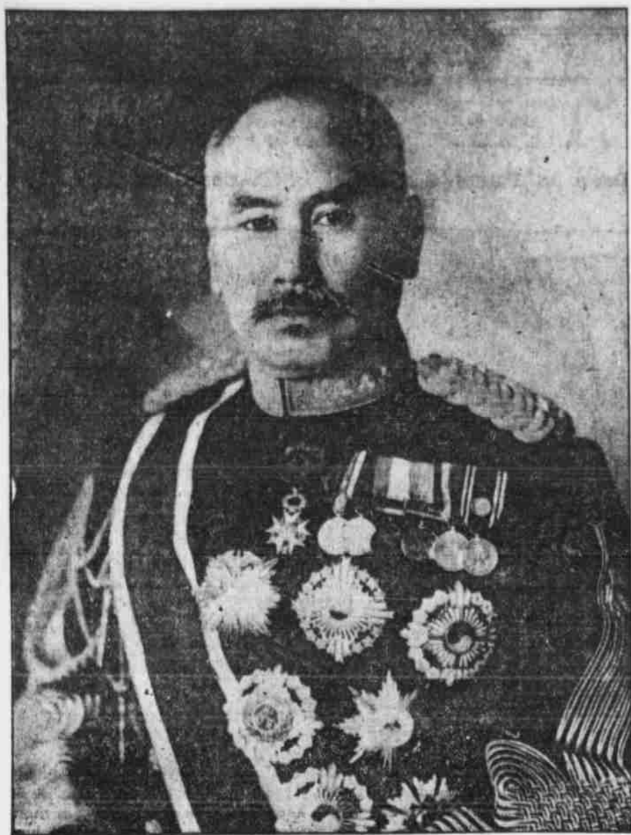
GENERAL HASEGAWA, "THE MAILED FIST OF THE MIKADO."