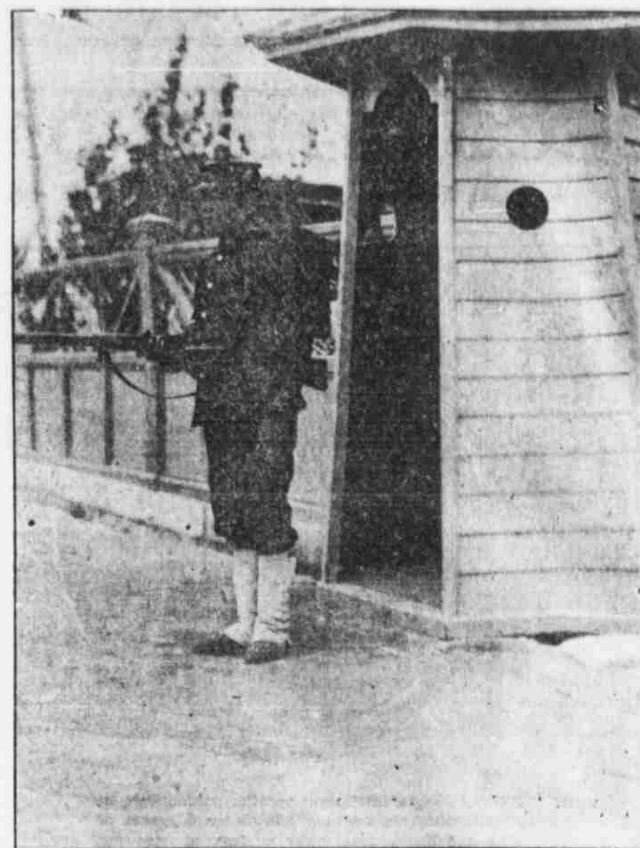
GUARD AT THE GENERAL'S HEADQUARTERS.

(Copyright, 1909, by Frank G. Carpenter.) S EOUL, 1909.—(Special Correspondence of The Bee.)—Have you ever heard of Yong-san? It is a great city in its beginning. Thousands of workmen are now building it and the structures being erected will, when completed, cost millions. It has one palatial residence which will be finer than any other building in the far east, outside of that of the crown prince of Japan. It will cost 500,000 yen, and it could not be built for that many dollars on United States soil. This will be the home of the commander-in-chief of the Japanese army in Korea, and it will be equipped for grand entertainments of every description. It will have fifty-six rooms. Its dining tables will seat 300 guests at one time and its dancing hall will accommodate a crowd of 500. Yong-san is about the military capital of Korea, and adjoining it is a large territory which will be devoted to the railway officials and other such men. Altogether the settlement will form the nucleus of a great Japanese city, which will extend toward and embrace Seoul, which is now two miles away.