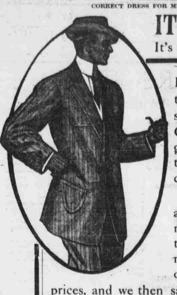
Correct Dress for Men and Boys