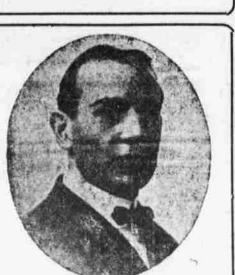
A. L. SCHANTZ

27 and 54-in, embroidery | 18-in, corset cover, em- | 150 pieces fancy flannelette in all shades, 27 and broideries, insertions and 36 inches wide, double bands in all widths, fine fold goods for house nainsook and Swiss efdresses and kimonos, 18c fects, worth 30c, at 15c