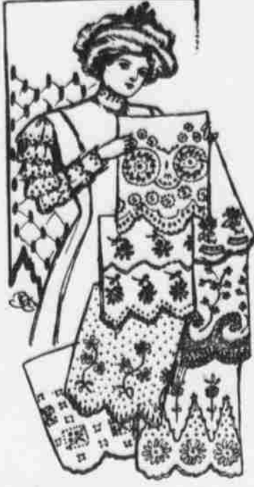
BUY ZION CITY LACES

35c Wide Skirt Flouncings 15c—Beautiful designs in Swiss and cambric, an elegant line of 53c values for selection, at... 15c Laces at Just Half Price—French and German Vals, Linen and Cotton Torchons, Point de Paris, and Oriental included, in 5 great lots, values from 5c to 25c yd.; choice, 2 1/2c 3 1/2c 5c 7 1/2c 12 1/2c Fancy Tuckings, Chiffons and Allover Laces—One big lot in cream, black, white and colors—values to $1.50; to close at... 19c Dress Trimmings, 3 1/2c, 7 1/2c, 12 1/2c and 19c—Special bargain offerings at these prices; Monday in order to quickly reduce stock. 50c and 75c Elastic Belts, on sale Monday... 39c 25c and 35c Elastic Belts, Monday at... 19c Hand Bags, well worth $2.00; choice... 95c