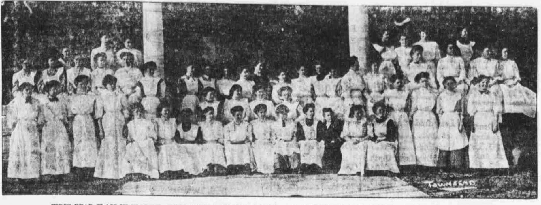
FIRST YEAR CLASS IN COOKING, HOME ECONOMICS DEPARTMENT OF UNIVERSITY OF NEBRASKA SCHOOL OF AGRICULTURE.

N THE dedication of the beau- this method the students literally live the tiful new Home Economics principles and the methods they are hall on the campus of the taught.