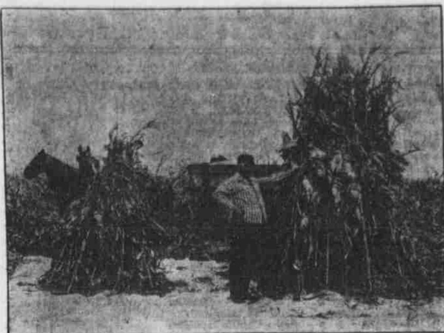
King Corn on His Throne