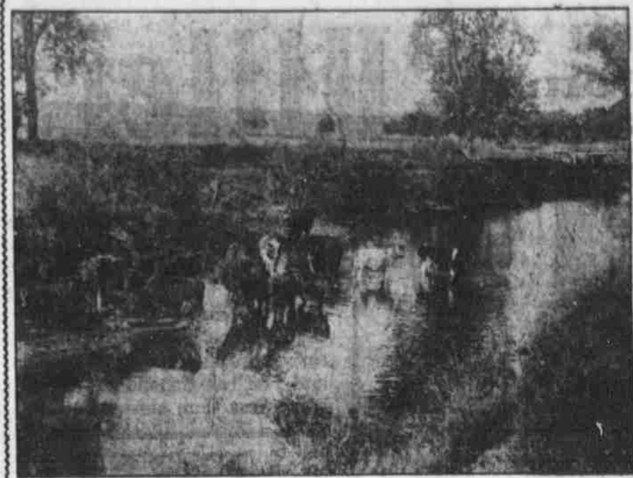
Basis of South Omaha's Greatness