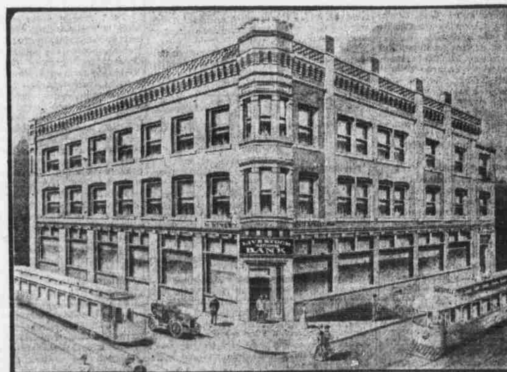
SPECIAL FACILITIES for HANDLING BUSINESS in CONNECTION with the LIVE STOCK INDUSTRY