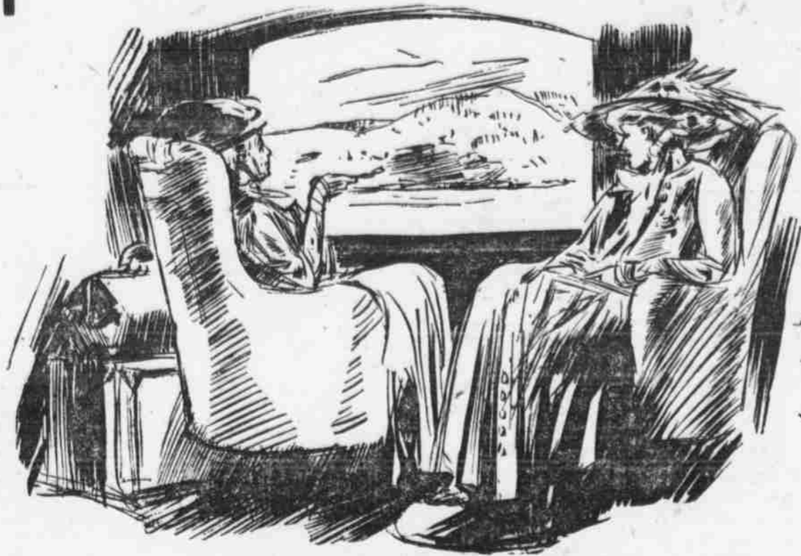
SHE CAPTURES A BURGLAR.