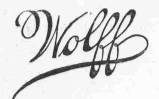
LADIES' TAILOR AND FURRIER N. E. Corner 16th and Howard.

Monday, I will sell all my $5.00 Linen Shirt Waists, at each