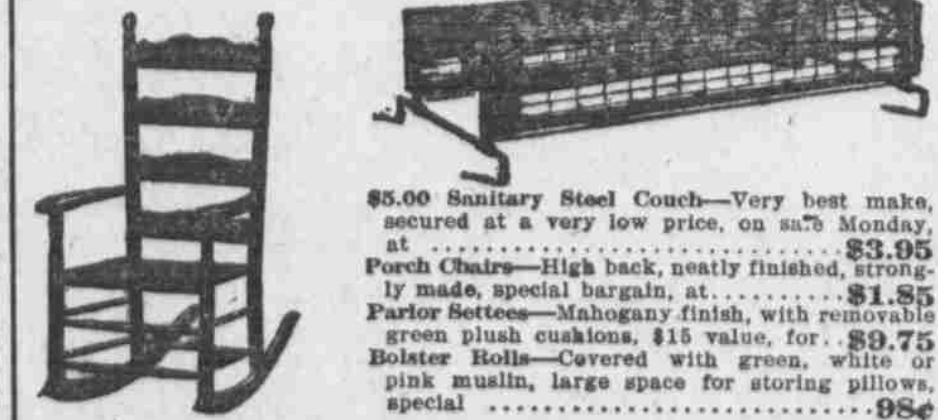
$5.00 Sanitary Steel Couch—Very best make, secured at a very low price, on sale Monday, at $3.95 Porch Chairs—High back, neatly finished, strongly made, special bargain, at $1.25 Parlor Settees—Mahogany finish, with removable green plush cushions, $15 value, for $9.75 Bolster Rolls—Covered with green, white or pink muslin, large space for storing pillows, special $9.95