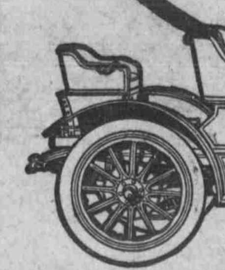
Model 34-A, Price $2,250.

RAMBLER AUTOMOBILE CO. 2044 Farnam St. Omaha, Neb. Agents Wanted. Liberal Contracts Given.