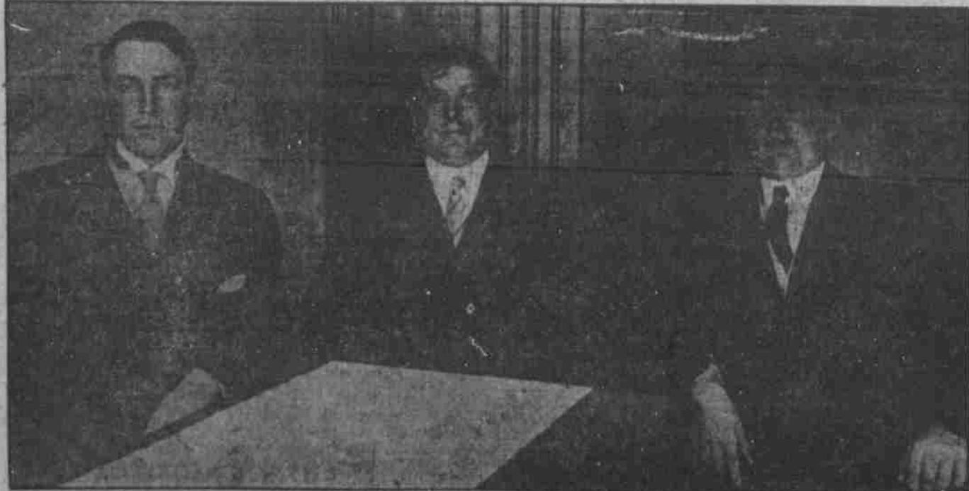
THREE OF THE BEST INDICATOR HANDLERS IN THE BUSINESS