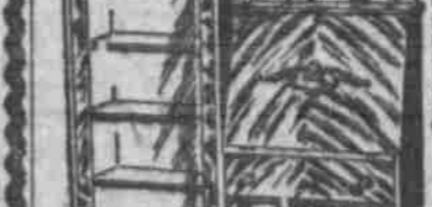
Axminster Rugs 12x9 Feet 23.75

This excellent Brussels Rug is made of the best materials, beautiful designs. Worth double the price we are asking.