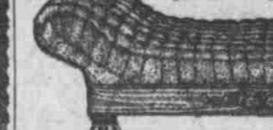
GENUINE LEATHER COUCH 22.50

New high arm Sewing Machine with ball bearing stand, latest improved spring tension, cylinder shuttle, automatic bobbin winder, self-cutting needle, and many other improved features. Does the finest work as well as sewing the coarsest fabric, all with equal satisfaction. With each machine we include a full set of attachments and a large assortment of accessories absolutely free of charge. Every machine is fully guaranteed—guaranteed for ten years.