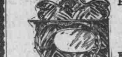
Colonial Library Table 11.75

This magnificent solid oak Sideboard is beautifully carved and of superior workmanship throughout. It is fitted with a large French plate beveled edge mirror. Lined drawer for silverware and large linen drawer. It is an exceptional value.