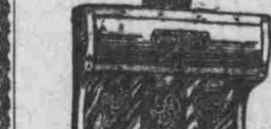
HARTMAN SPECIAL STEEL RANGE 26.75

This Couch offers outdoor previous efforts. Just consider the price and bear in mind that it is a massive Couch made with a solid oak frame, beautifully carved—made with full steel spring construction with the top deeply tufted and covered with genuine leather. It is a world-beater at the price.