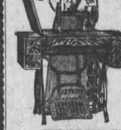
HIGH ARM DROP HEAD SEWING MACHINE 18.75

New high arm Sewing Machine with ball bearing stand, latest improved spring tension, cylinder shuttle, automatic bobbin winder, self-cutting needle, and many other improved features. Does the finest work as well as sewing the coarsest fabric, all with equal satisfaction. With each machine we include a full set of attachments and a large assortment of accessories absolutely free of charge. Every machine is fully guaranteed—guaranteed for ten years.