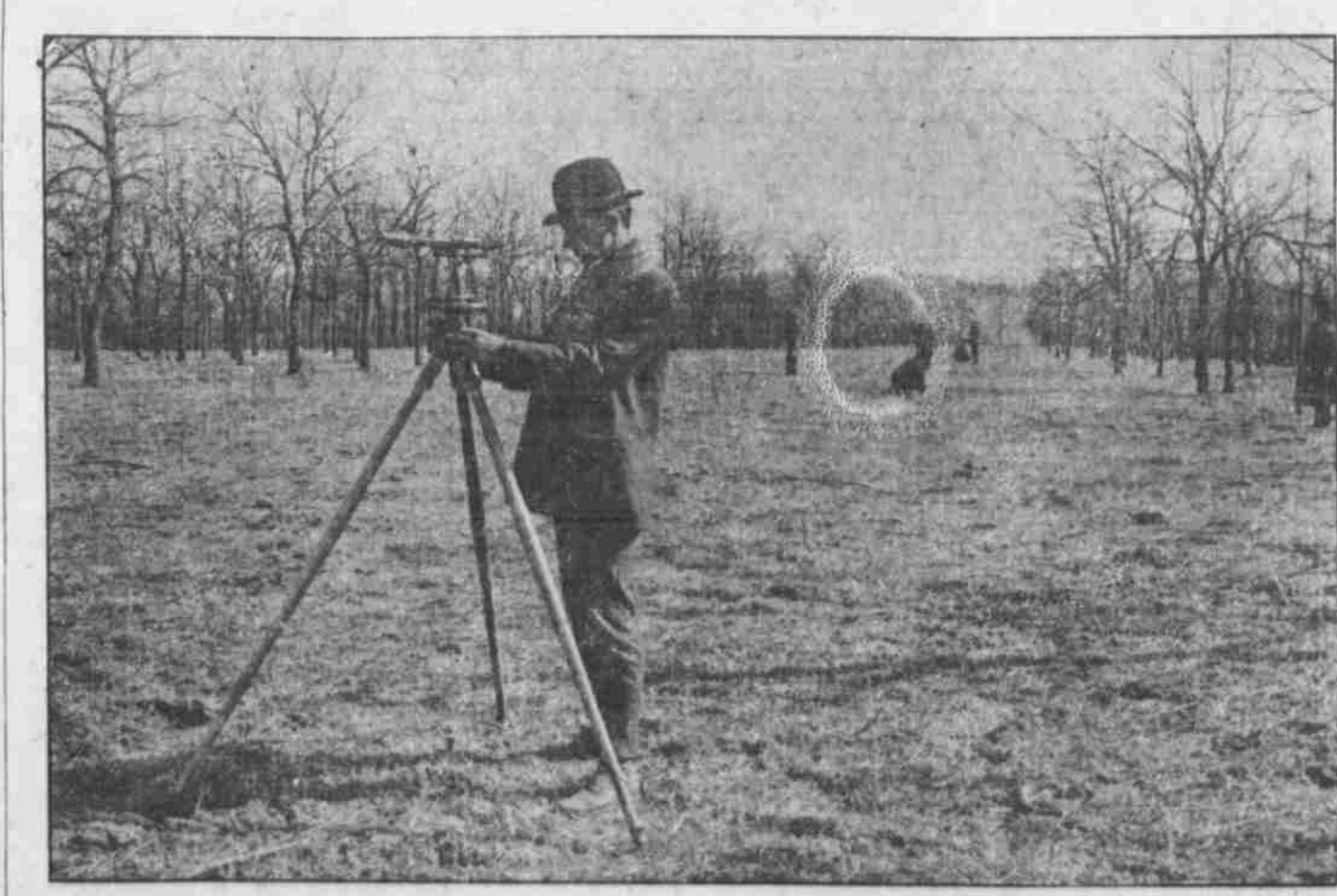
ENGINEERS LAYING OUT THE TOWN OF RALSTON.