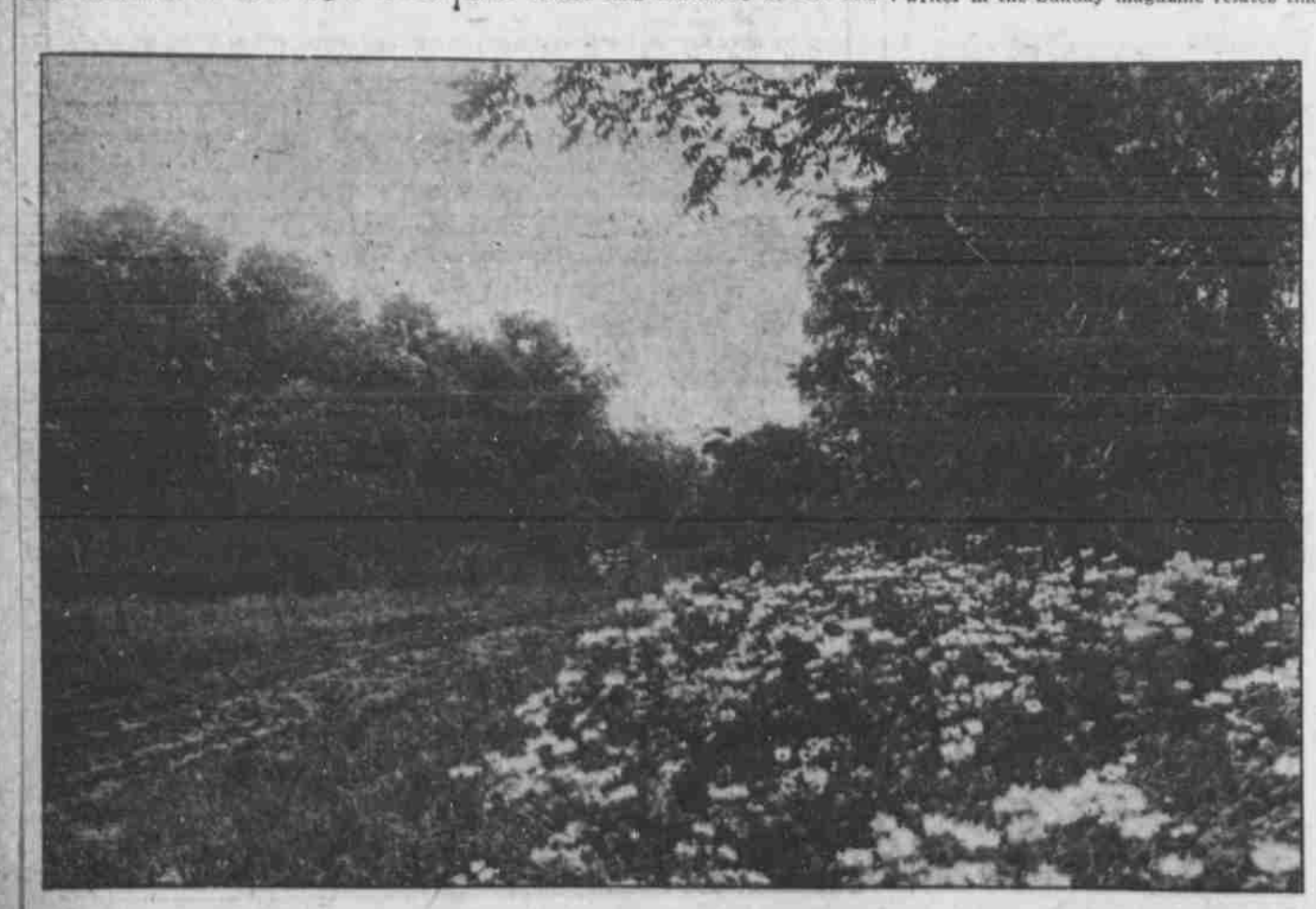
A NATURAL BOULEVARD IN THE FUTURE RESIDENCE DISTRICT OF RALSTON.

of the townsite. The Burlington will them their needs.