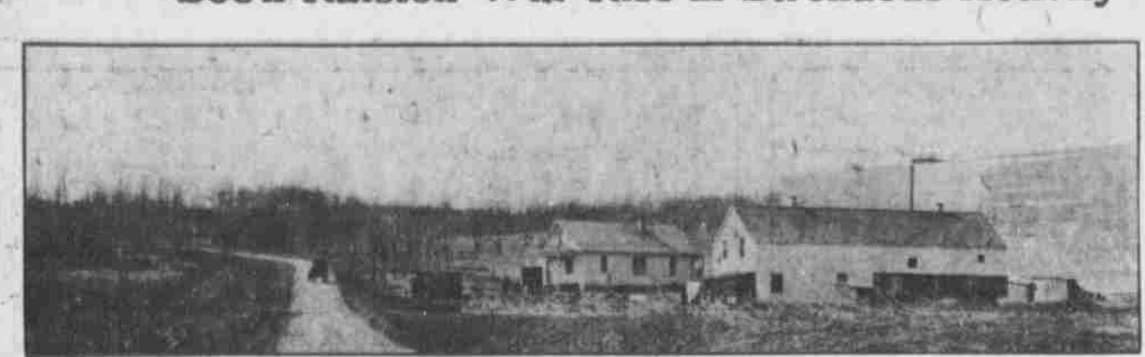
MACADAMIZED ROAD RUNNING THROUGH RALSTON TOWNSITE PROPER, TO BE THE MAIN STREET OF RALSTON.

Soon Ralston Will Rise in Strenuous Activity Where Deer Once Roamed Through Beautiful Groves in Idyllic Security