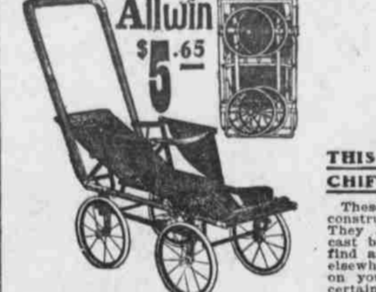
ALLWIN FOLDING GO-CART FOR... 5.65

This large Mission Rocker, made of selected material, imported reed seat, is offered at a price that is positively unbeatable. It is of artistic Mission design, weathered finish, broad shapely back. You must see this article to appreciate the true value.