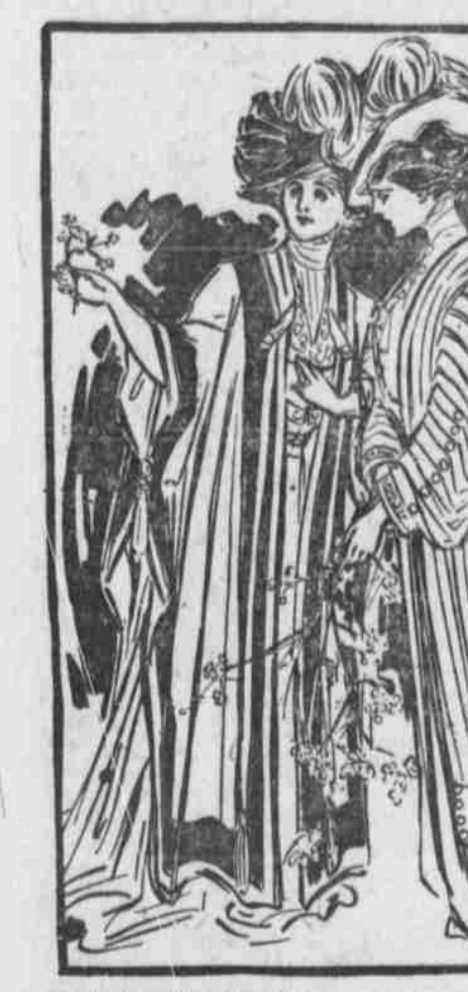
DUST COATS OF PONGEE, CLOTH AND VOILE.