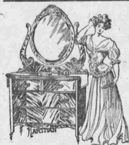
DRESSER IN OAK OR MAHOAGNY FINISH... 8.15