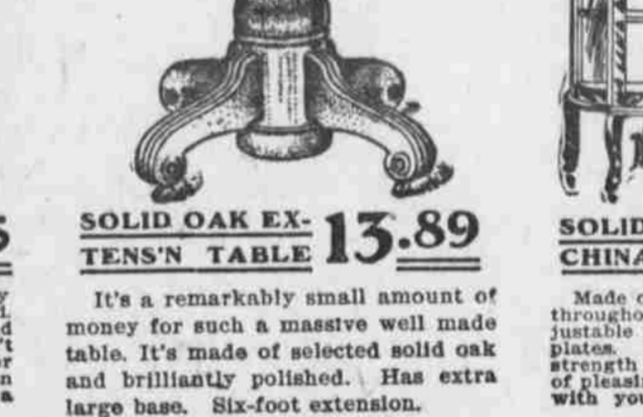
SOLID OAK EXTENSION TABLE... 13.89