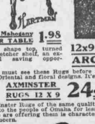
12x9 IMPERIAL MON. ARCH BRUSSELS RUG... 12.75