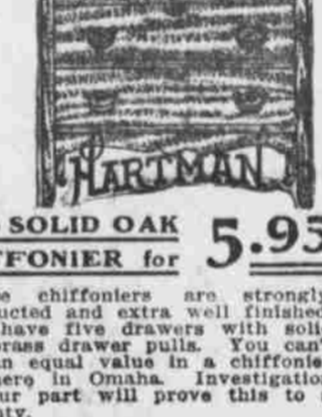
THIS SOLID OAK CHEFFONIER for... 5.95