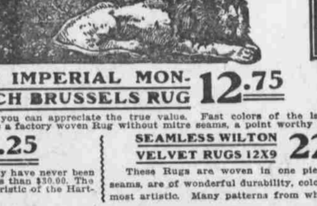
SEAMLESS WILTON VELVET RUGS 12x9... 22.50

These rugs are woven in one piece and have no seams, are of wonderful durability, coloring and designs most artistic. Many patterns from which to select.