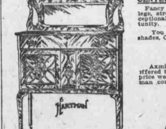
SOLID OAK BUFFET... 15.75