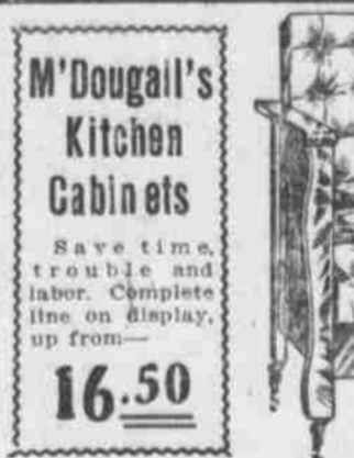
M'Dougall's Kitchen Cabinets... 16.50