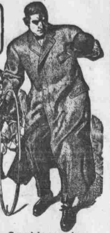
Copyright 1908 by Hart Schaffner & Marx